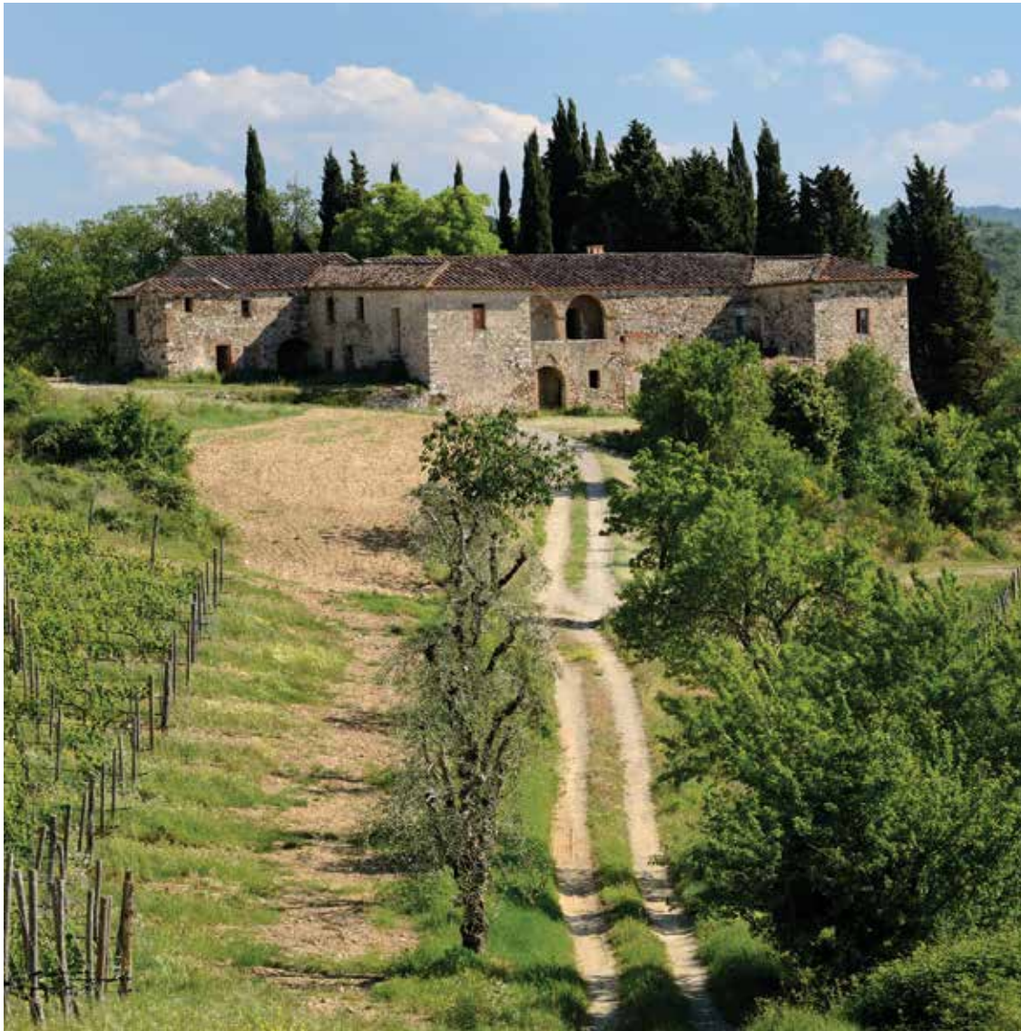
Above: Rancia, from the ancient Frankish "Grange": farm-monastery dating to before 1000. Previous page: Fèlsina